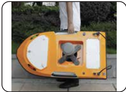
Compact and lightweight, one man hand carry, easy launch and retrieve