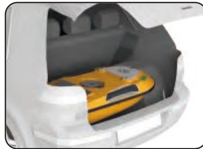
105cm length easy in field transportation