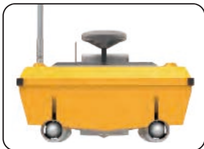
Top speed 5m/s. Rugged and robust design for thruster protection