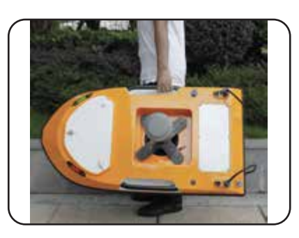
Compact and lightweight, one man hand carry, easy launch and retrieve