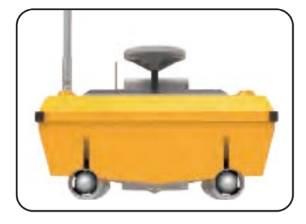
Top speed 5m/s. Rugged and robust design for thruster protection