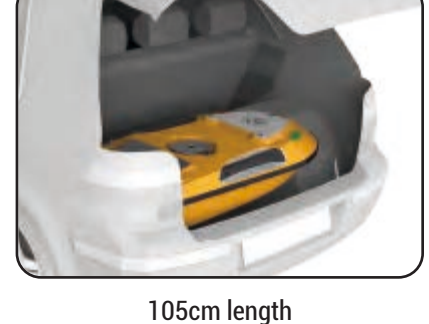
105cm length easy in field transportation