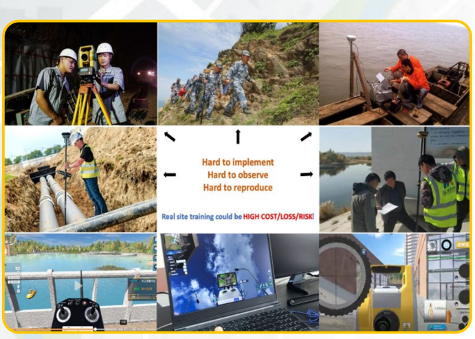
And now, VR-Geo consists of 2 categories, VR Combos and VR Programs.