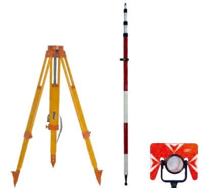
ATS-2B Fiberglass Tripod NLS-15 Prism Pole TK21T Prism Set